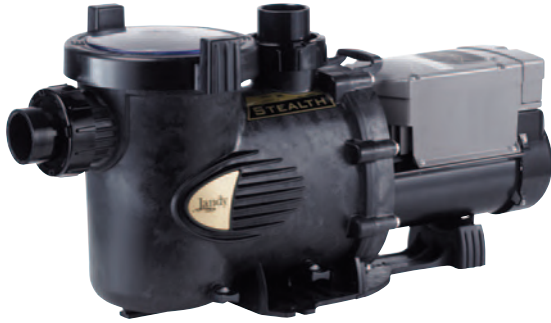
Jandy® ePump™ by Zodiac®