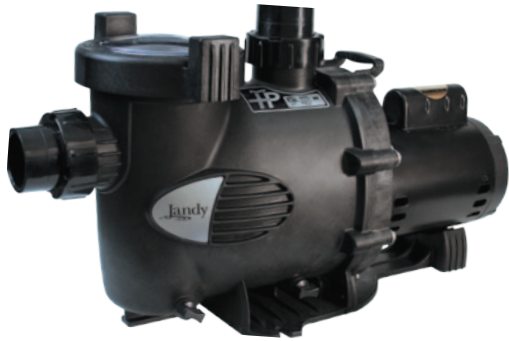
Jandy® PlusHP Pump by Zodiac®