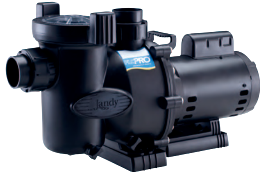
Jandy FloPro™ Pump by Zodiac