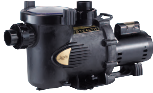
Jandy Stealth™ Pump by Zodiac