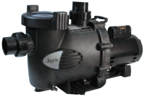
Jandy® Water Feature Pump by Zodiac®