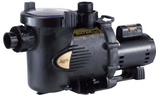
Jandy WaterFall Pump by Zodiac